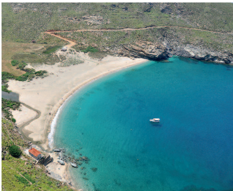
TRUE BLUE Above, from left: A bird's-eye view of Ahla Beach, on the east coast of Andros; inside one of the stone guest cottages at nearby Onar.